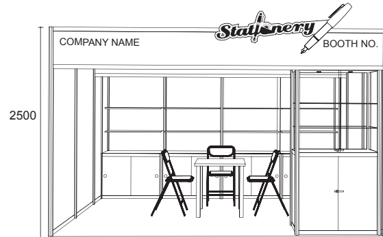
3m (D) x 4m (W)