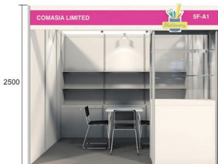
3m (D) x 3m (W)